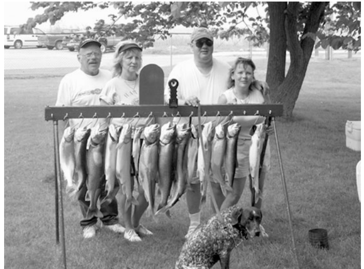
Second Place Winners