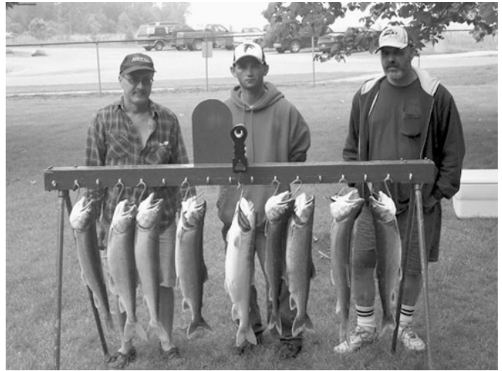
First Place Sunday

Total Boats – 9 Total Anglers – 28 Total # of Fish Weighed-In – 70 Conditions – Calm, Foggy Picnic – Scott Terrello