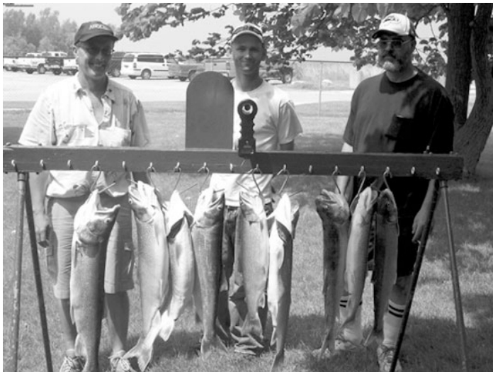
First Place Saturday