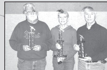
Twilight Winners Eveeady Crew

Here are winning captains and crews from the BWSA 2006 club tournament trail. Congratulations and we wish you good luck in 2007.