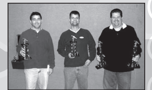
Ludington Winners King Kong Crew