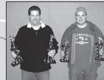
Harbor Beach Winners King Kong Crew